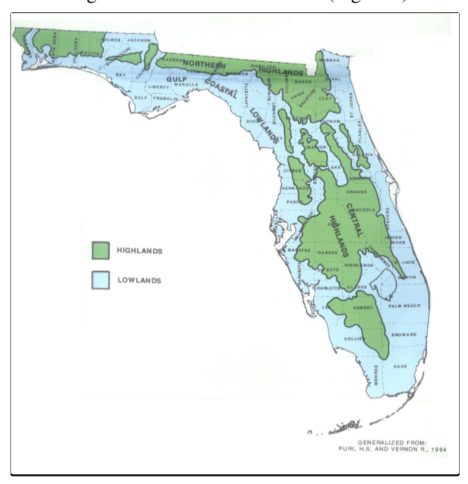
Figure 3. Landforms of Florida. FLGS Map Series No. 112

Regionally, Florida can be divided into north and central highlands and coastal lowlands (Figure 3).